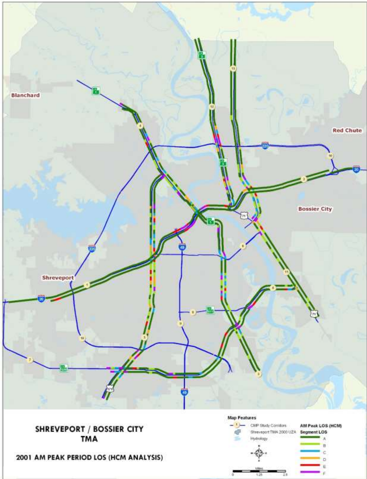
Figure 2.2: 2001 AM PEAK PERIOD LOS DETERMINATIONS