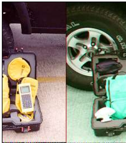
Fig. 2a-1; Trimble's Pro/XL GPS Receiver