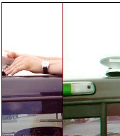
Fig. 2a-2; Attaching the Dome Antenna to the Test Vehicle